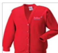
Red Dallow Cardigan