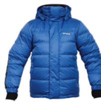
Coats with names written inside