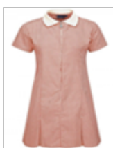
Red Checked Dress