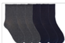
Black or Grey Socks