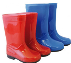
Wellington Boots to stay in school