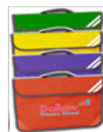
House Team Coloured bag