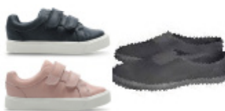
Trainers or Black Plimsolls