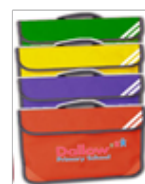
House Team Coloured bag