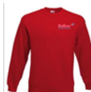
Red Dallow Sweatshirt