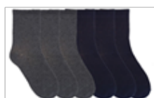
Black or Grey Socks