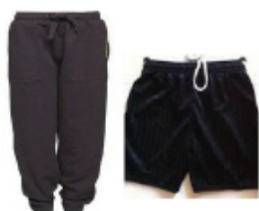
Black joggers or shorts