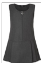
Grey Pinafore Dress