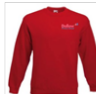
Red Dallow Sweatshirt