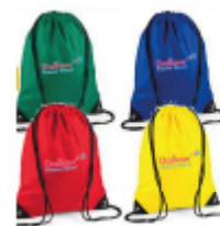
House Colour Bag