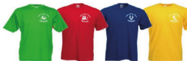
House Colour T-shirt